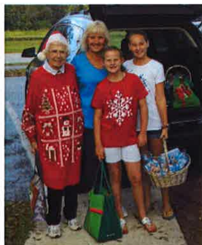
Left: Members of the Beta Sigma Phi Sorority, along with their children and grandchildren, brought home made goodies for each of our residents. This has become an annual tradition of the BSP Sorority!

The Blessings OF Christmas PEACE • HOPE • JOY • LOVE